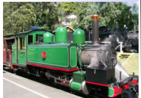
Puffing Billy's Engine.

One of the features of Melbourne was a trip on the 'Puffing Billy' train which ran from Belgrave, a North Eastern Melbourne suburb, 24 km up into the Dandenong Ranges. The 'Puffing Billy' is a well known tourist attraction in Melbourne and we would certainly recommend a ride on it if you have a few hours spare.